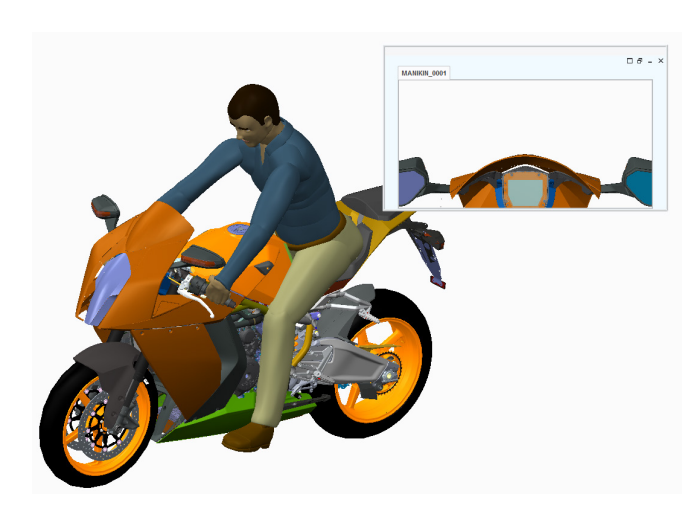
Creo Manikin Extension lets you quickly insert manikins into your 3D CAD model to visualize and optimize human-product interactions.

Digital human modeling supports a human-centric approach to design by allowing a designer to add a 3D digital human model to their 3D CAD product model. A digital human model – also called a manikin – is an advanced 3D mechanism that provides an accurate representation of human physical characteristics such as size, shape, vision, movement, strength and comfort. The manikin can be customized for a specific gender and ethnic demographic and fully manipulated in real time, thereby helping the designer better understand the relationship between a product and the people interacting with the product, such as a consumer, operator, installer, assembler or maintainer.